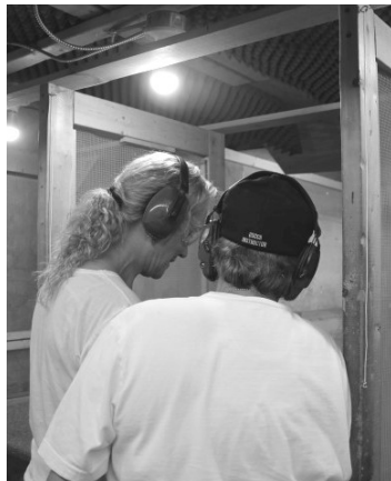
On-site certified trainers

We also bring a woman's perspective to shooting including shooting stance and grip, selection of firearms, concealed carry options, and self-defense concerns.